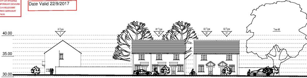
Streetscape Elevation 4 - Looking South West Towards Plots 21 - 25