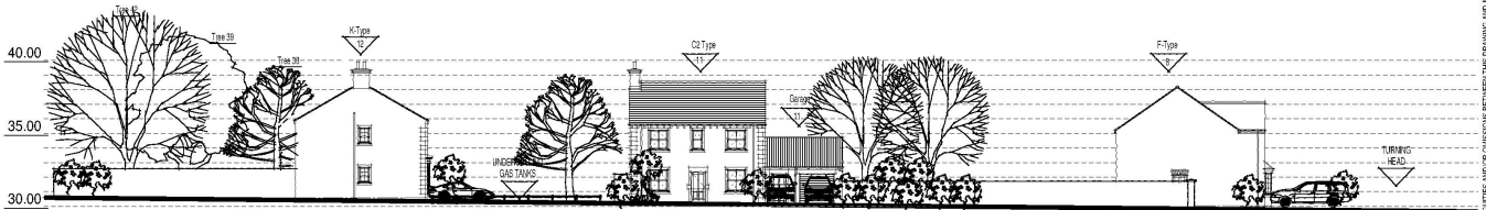
Streetscape Elevation 6 - Looking South East Towards Plot 11